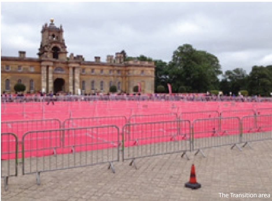
The Transition area

'I'm not going to deny the fact that massaging at events is a long day, and when you get home and sit down you realise how exhausted you actually are. But it is so true that time flies when you're having fun, and just to meet some of the most inspiring people in a short space of time makes the whole thing totally worthwhile. Massaging competitors is uncomplicated, and there is always help at hand. In fact you'd be surprised at how natural it all feels after the first treatment is out of the way. It becomes about the interaction with the person on your couch, and being able to share their journey and event experience.'